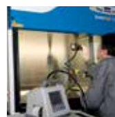
FILTER LEAKAGE TEST