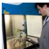
AIR FLOW SPEED TEST

Each Faster cabinet is tested conforming to EN 12469:2000, DIN 12980:2005, EN 61010:2001 and released with FAT certificate of the tests performed.