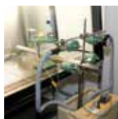
KI DISCUSS TEST